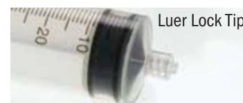
Luer Lock Tip