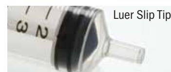
Luer Slip Tip