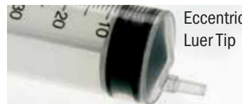
Eccentric Luer Tip